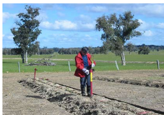
Figure 2. Elite clone seedlings (the left) and scenery of the planting (the right).

We will measure growth rate and photosynthetic activity of the planted trees. We will improve the practical use of elite clone planting through evaluation of Forest of RITE in terms of CO 2 reduction.